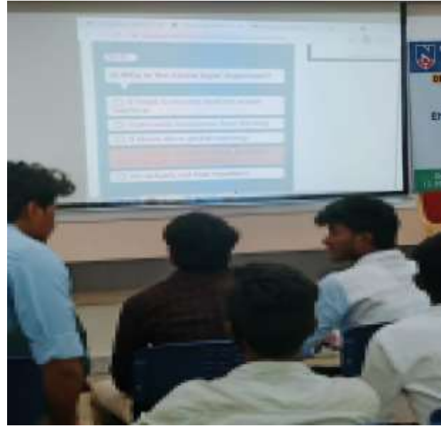
Students participating in Technical Quiz Competition