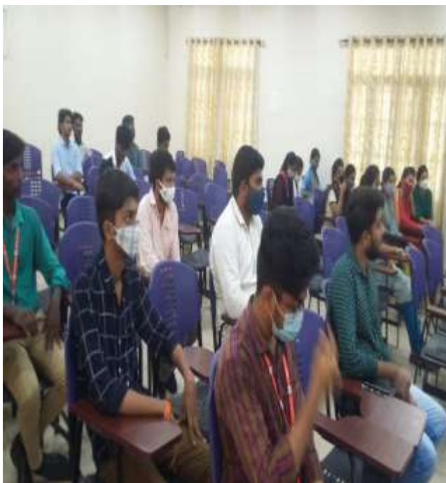
Students during event